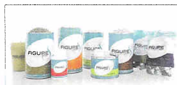
FIGURE 8 ® WEIGHT LOSS SYSTEM Four products make it simple, 8 dietary elements make it work