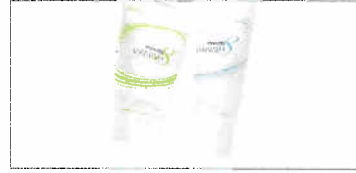
FIGURE 8 VANISH ™ 2-Step Cellulite System

FIGURE 8 ® WEIGHT LOSS SYSTEM Four products make it simple, 8 dietary elements make it work